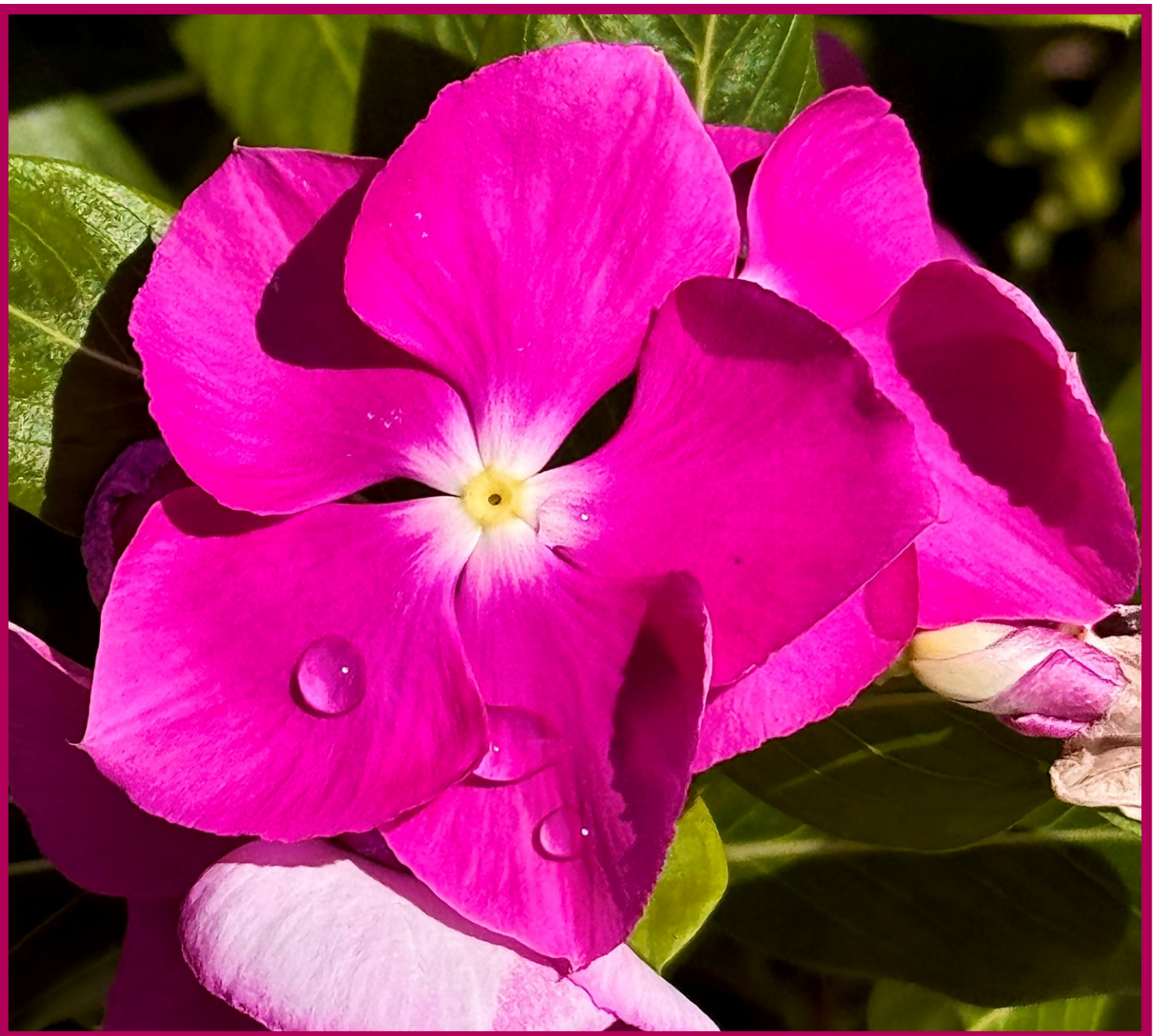
Sandhill Cove Periwinkle